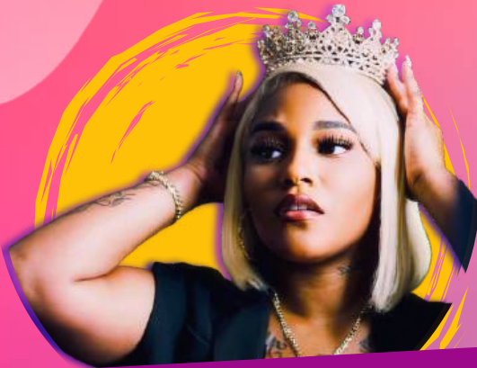
CROWNED BY SAVVY @crownedbysavvy